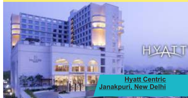
Hyatt Centric Janakpuri, New Delhi