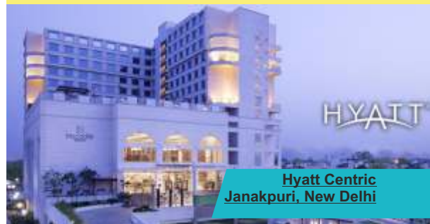
Hyatt Centric Janakpuri, New Delhi