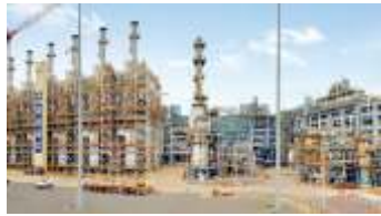
RIL - Petcoke Gasification, Jamnagar