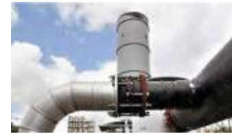
Great Eastern Energy Corporation Ltd - pioneered exploration, production, and development of CBM in India