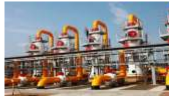
Essar - Coal Bed Methane, Raniganj