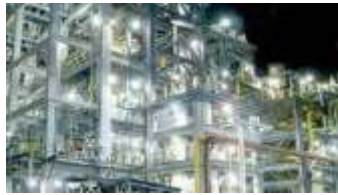
JSPL - Coal Gasification, Angul